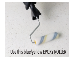
Use this blue/yellow EPOXY ROLLER

**IMPORTANT: USE ONE FULL STONESET EPOXY KIT PER 20 SQ. FT. for a smooth wet application**