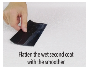
Flatten the wet second coat with the smoother

flat and thin. (2) Use the 4" roller to apply a flat, uniform coat about 1/16" thick across the raised backsplash (if present) and the rest of the countertop including the edges. Roll over the wet material a few times to make it uniform as you go. The applied material will look very rough, which is normal.