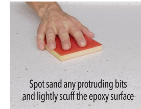
Spot sand any protruding bits and lightly scuff the epoxy surface

SURFACE PREPARATION: (1) Rub your hand across the surface to feel for any little protruding pimples in the finish and spot-sand to remove them with the enclosed sanding sponge. (2) Lightly scuff the remaining dry epoxy surface with the sanding sponge. (3) When complete, wipe down the surface with a wet lint-free cloth until there is no dust residue visible on the cloth or your hand. (4) Do a final wipe with a