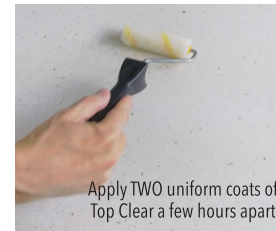
Apply TWO uniform coats of Top Clear a few hours apart

dry lint free cloth and the surface is ready.