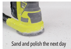
Sand and polish the next day

COAT TWO: (1) Use the 1" brush to apply Stone Coat into corners, along edges and tight areas around faucets, etc. (2) Follow with roller application of the second coat just as before. (3) As you go, while the material is still wet, use the plastic smoother to flatten the wet material for a smooth and uniform result. Press firmly to spread it on thin and uniform and fill any indentations from the first coat. This simple step will minimize any sanding that follows.