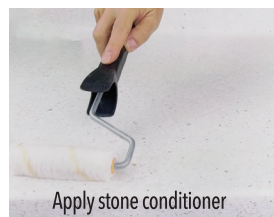
Apply stone conditioner

POLISH AND CONDITION THE STONE: With your second coat of LuxROCK dry and cured for 24 hours , it's time to sand and condition the stone. (1) Use the enclosed medium grit sandpaper to shave away any significant roughness or bumps and polish the overall surface. Sanding can be done by hand, but using a random orbital sander is recommended for easiest and fastest results. (2) For the raised backsplash and front edges, use the enclosed sanding disc and sponge to smooth any rough bits by hand for smoothly contoured edges and verticals. (3) Vacuum