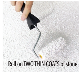
Roll on TWO THIN COATS of stone

MIXING: (1) Add a half cup of water to the LuxRock Stone Coat mix. (2) Use the enclosed stir stick (or a drill mixer) to stir the mix from the bottom up to disperse any settled material at the bottom of the can and blend everything uniformly.