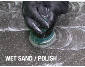
WET SAND / POLISH

SURFACE PREPARATION: The previously applied StoneSet epoxy coat must be wet sanded prior to application of Top Clear. This is an easy and important step that removes any pimples and other imperfections and prepares the surface for the final clear coat step that comes next. Use the enclosed dust mask while sanding. 1) Use the included misting spray bottle to wet the countertop surface lightly and uniformly prior to sanding and continue misting as you go. This will eliminate dust and lubricate the surface for smoothest polishing. 2) Though you can perform this step by hand, we recommend using a random orbital sander with the enclosed 400-grit sanding disk for easiest and best results. Use the same 400 grit sanding disc to wet sand the countertop edges and small backsplash by hand. 3) This step is faster and easier than it sounds. Just shave off